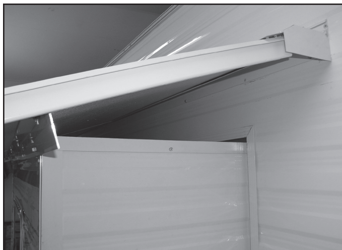
Before Gable End