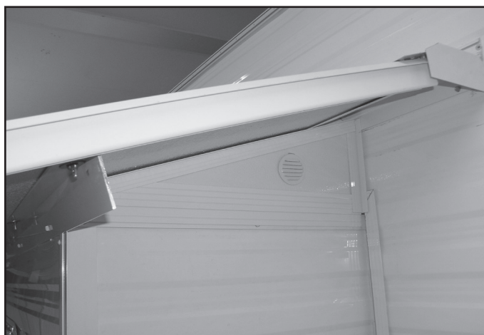
After Gable End

Read the instructions before starting the job. They explain the steps required to produce a finished product that will meet factory specifications.